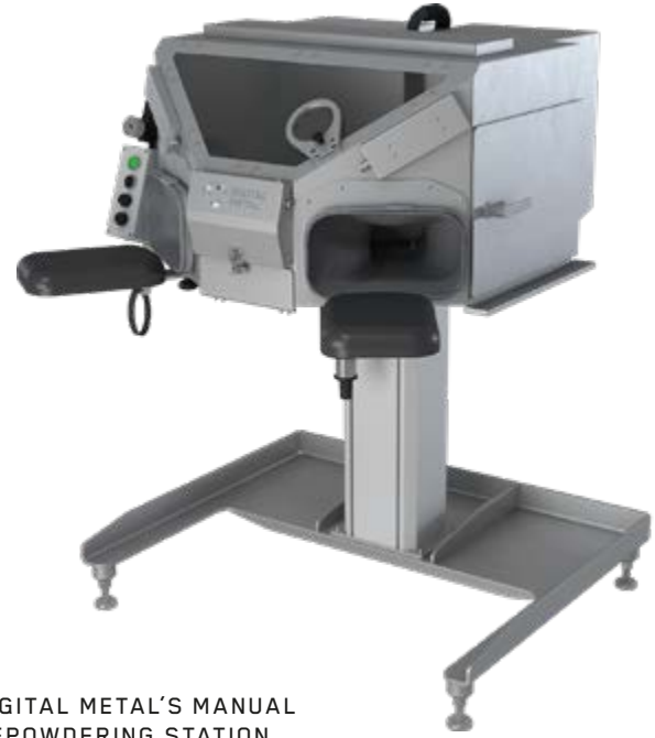
DIGITAL METAL'S MANUAL DEPOWDERING STATION